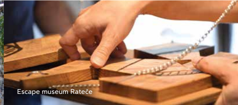
Escape museum Rateče