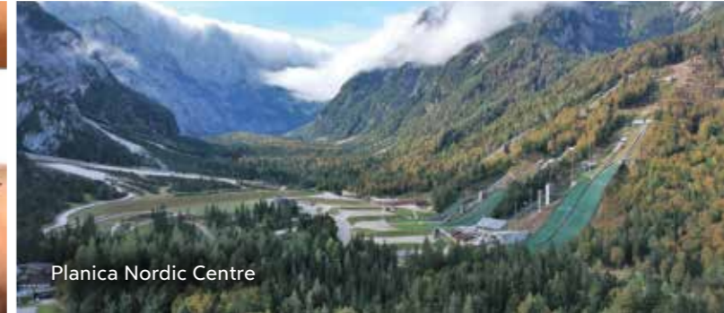
Planica Nordic Centre