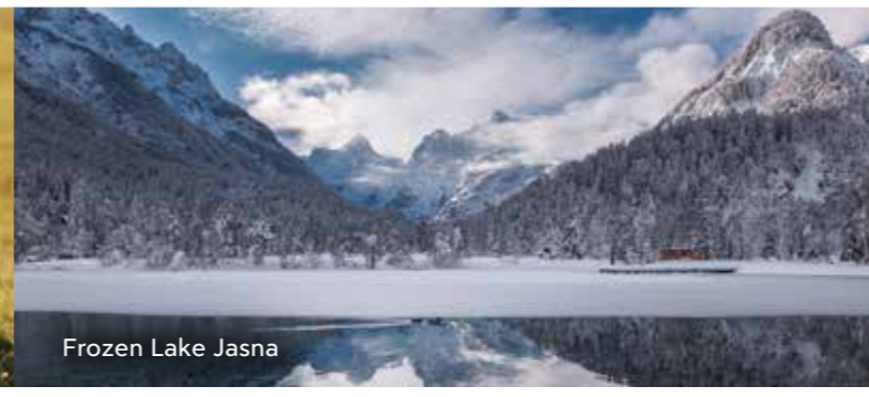
Frozen Lake Jasna