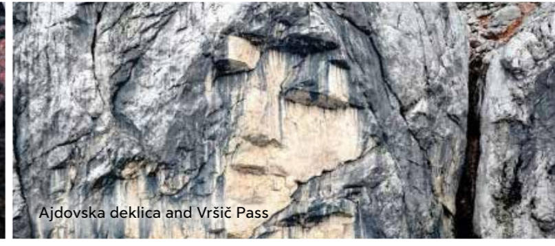
Ajdovska deklica and Vršič Pass